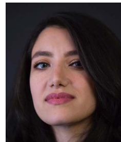
Director and Writer