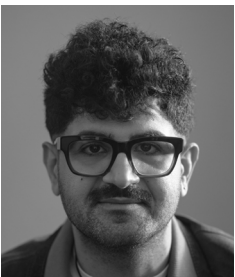
Director and Writer