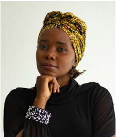
Director and Writer