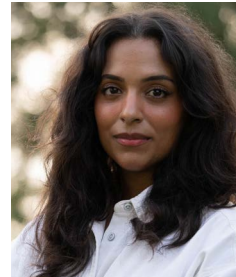
Director and Writer