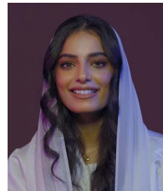
Director and Writer