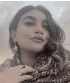
Director and Writer